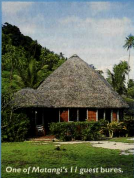
One of Matangi's 11 guest bures.